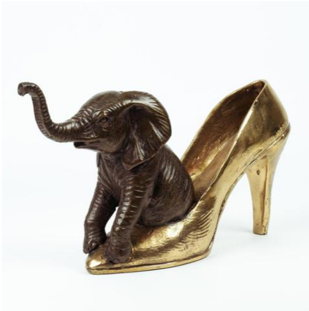
Gillie & Marc Walk With Elephant Bronze Edition of 25 7.5" H x 3.5" L x 13.4" W $4,200