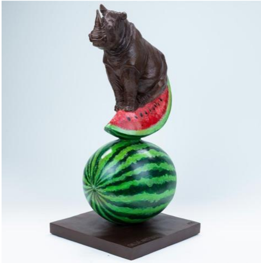
Gillie & Marc Rhinos Love Watermelons Bronze Edition of 100 16.1" H x 7.9" L x 7.9" W $6,500