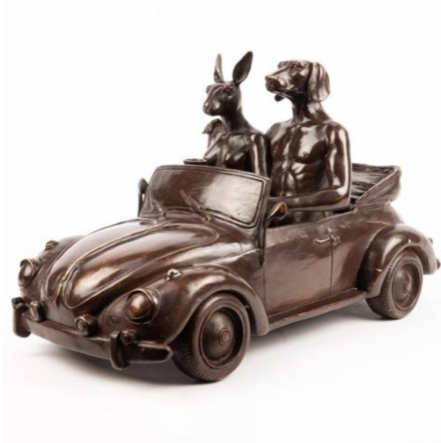
Gillie & Marc They Had The VW Car Bug Bronze Edition of 15 16.9" H x 7.9" L $4,200