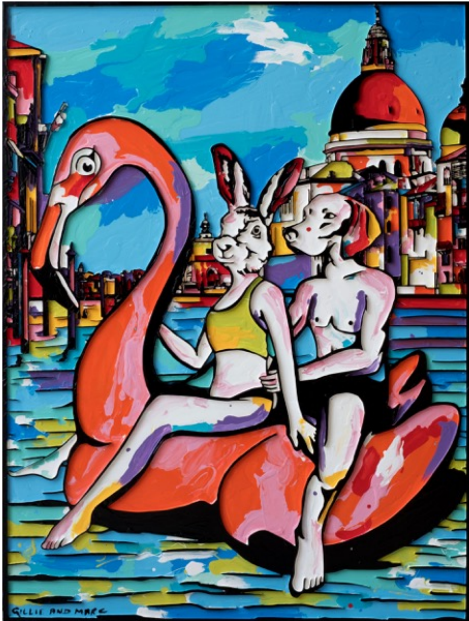
Gillie & Marc They Fell in Love in Venice Enamel on Wood 46.5" x 35" $9,000